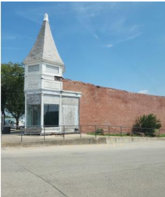
BRUMM BUILDING. 2023.